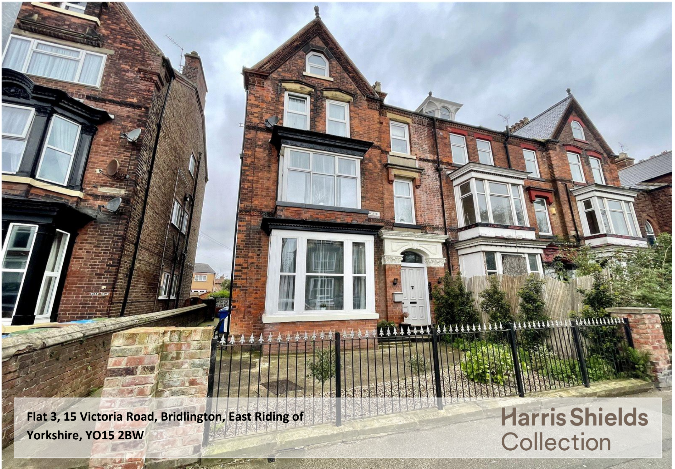
Flat 3, 15 Victoria Road, Bridlington, East Riding of Yorkshire, YO15 2BW